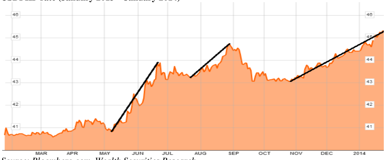
USDPHP rate (January 2013 – January 2014)

We will be closely watching for these subtle changes in character, that the Philippine peso will slowly be differentiated from the genuinely vulnerable currencies like the Argentine peso, Turkish Lira, South African rand and the Brazilian real.